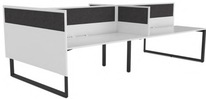
4 User Workspace with integrated cable duct with Breathe Slate Grey Screen Dividers

Cable trays - system includes desk to desk bridges, power/ data mounting points (inside the tray or on the vertical face) and cable snakes to the desktop