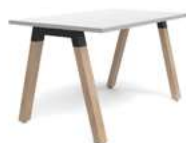
Plantation Single Sided Desk

Supplied in individual components to allow for a wider range of variations in length and width.