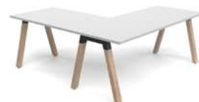
Plantation 90° Workstation