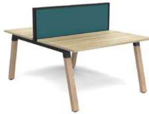
Double Sided Desking with AcoustiQ Dark Peacock Green Screen

Cable trays - system includes desk to desk bridges, power/ data mounting points (inside the tray or on the vertical face) and cable snakes to the desktop