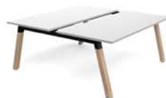
Plantation Double Sided Desk