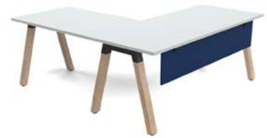
90° Single User Workspace with AcoustiQ Blue Modesty Panel