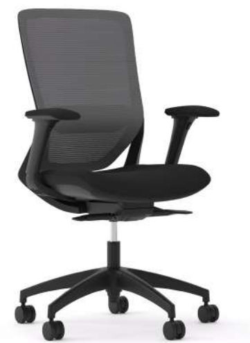
Engage Chair with Upgraded Arms - Black