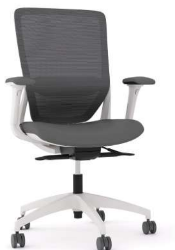
Engage Chair with Upgraded Arms - White