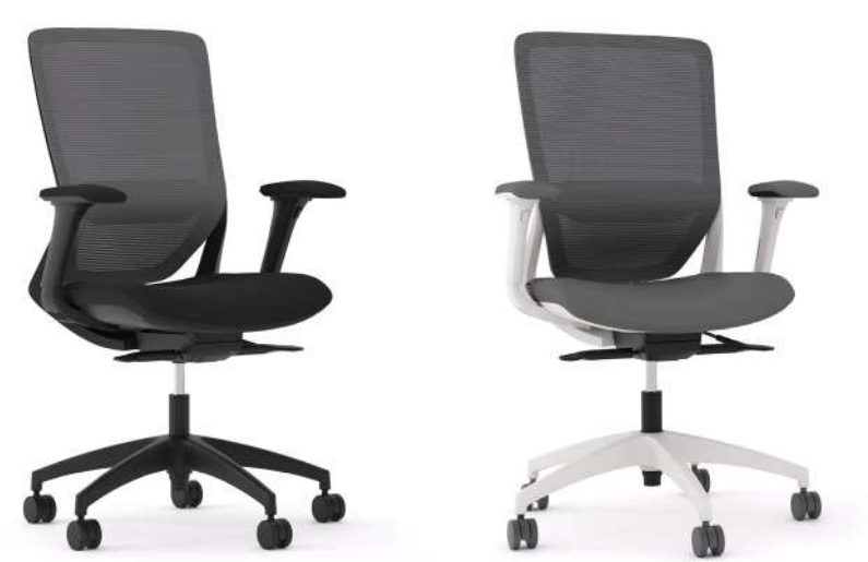
Engage Chair with Upgraded Arms - Black