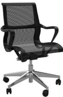
Polished base & Gas Lift upgrade for Black Scroll Chair