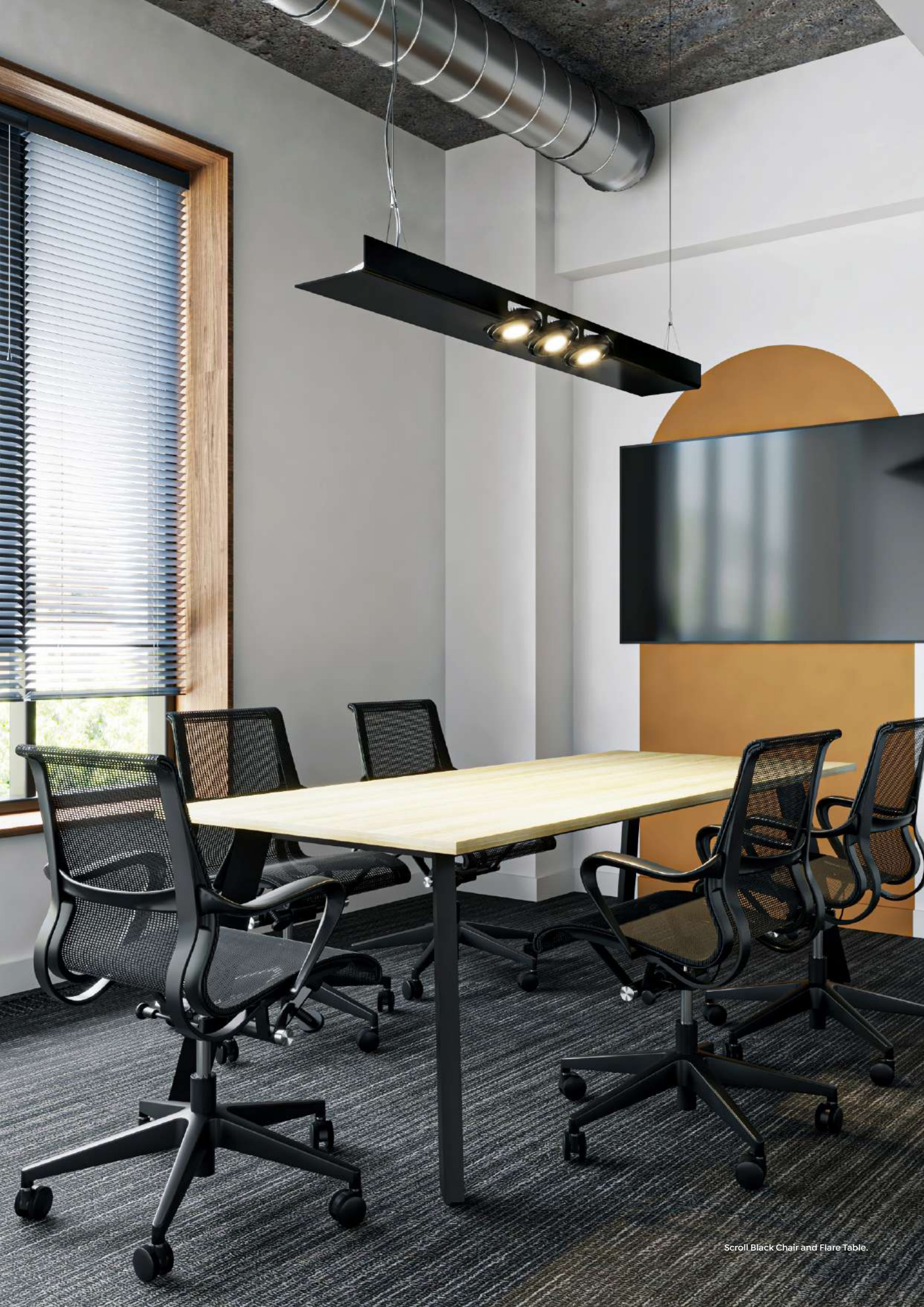
Scroll Black Chair and Flare Table.