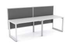
Anvil 2 User Single Sided Desk with Studio50 Screen