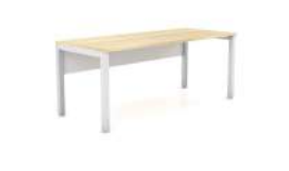
Axis Single Sided Desk with Modesty