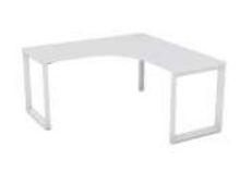
Anvil Single Sided 90° Workspace