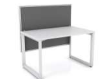
Anvil Single Sided Desk with Studio50 Screen