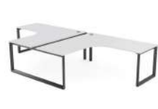
Anvil 2 User Double Sided 90° Workspace