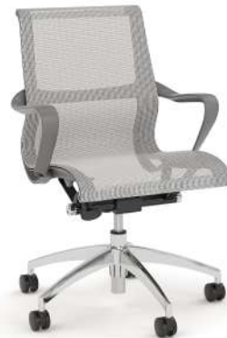
Scroll Grey Mesh Alloy Base