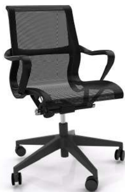
Scroll Black Mesh Nylon Base