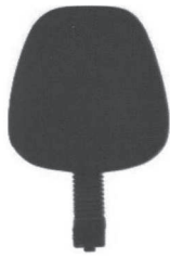
Back with bellow