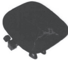
Seat with mechanism