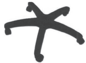
Base with castors